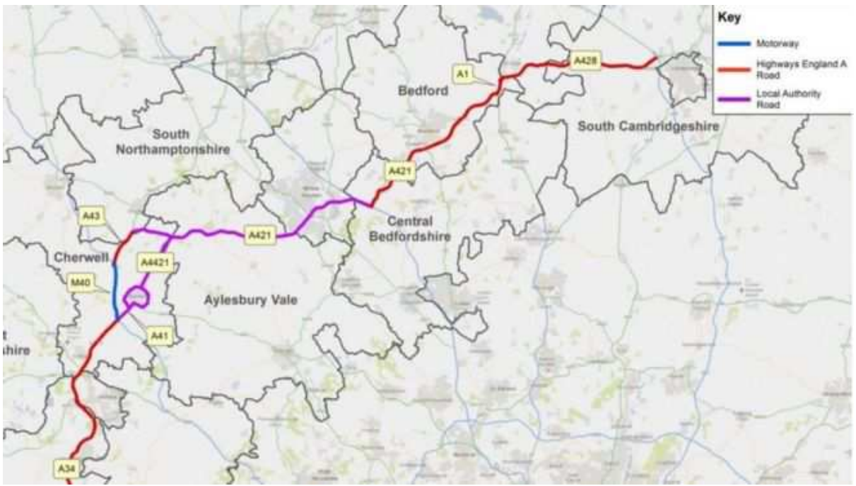
BBC News Report 16 August 2017

A government study has said a "brain belt" expressway between Oxford and Cambridge could boost the UK economy.