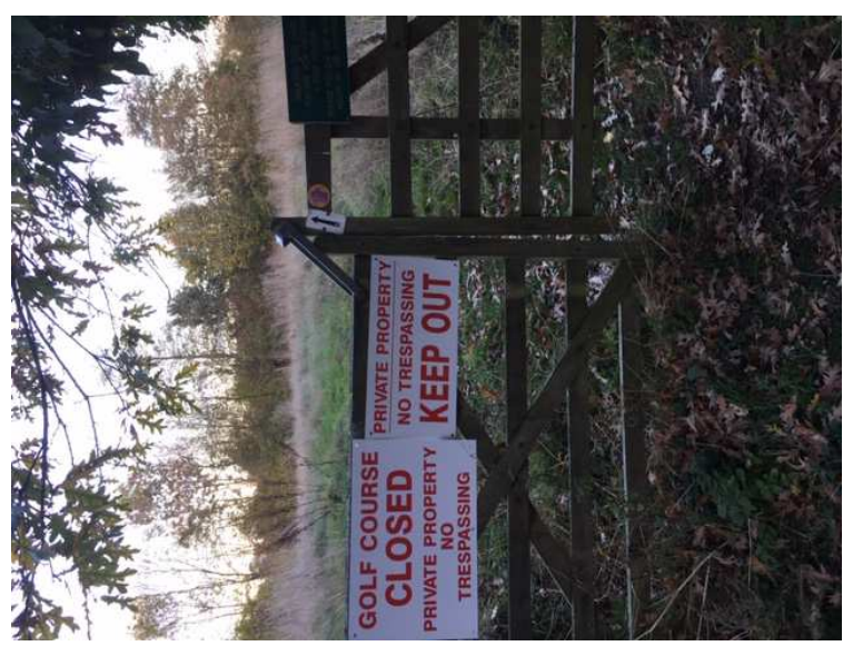
Wavendon Golf Club

MKC officers have held a preliminary meeting with Danesborough Forum members with a view to establishing those members as the Stakeholder Group responsible for advising MKC on the wording of the Development Framework.