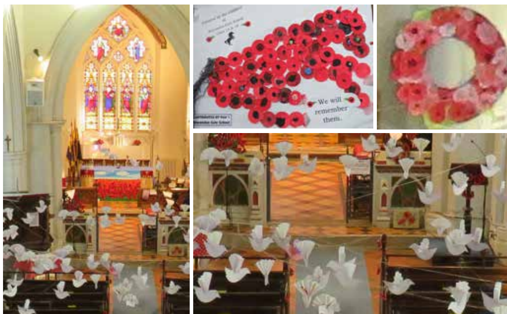
'Poppies' / 'Warhorse': children of Wavendon Gate School; 'Doves': people of Wavendon / St Mary's Church & School / Little Oaks Nursery