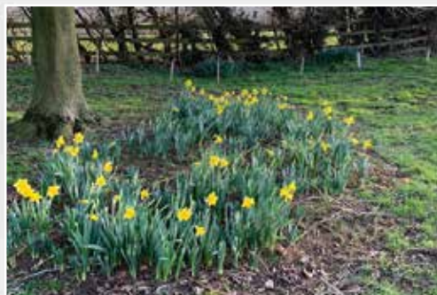
Daffodil bulbs donated by Cllr Victoria Hopkins

With the weather warming up the Volunteers are gearing up for a busy year of activities.