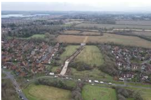
H10 Project Overview

H10 Extension (Bletcham way) The H10 extension from Wavendon Gate into Church Farm and then towards a junction (eventually – several years in the future) with Newport Road is slowly getting underway on the preliminaries. MK City Council report to the town council as follows