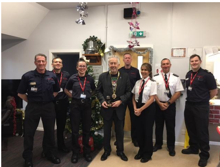
Bucks & MK Fire

I was delighted to visit the team at our local Broughton Fire Station just before Christmas, taking gifts from the local community.