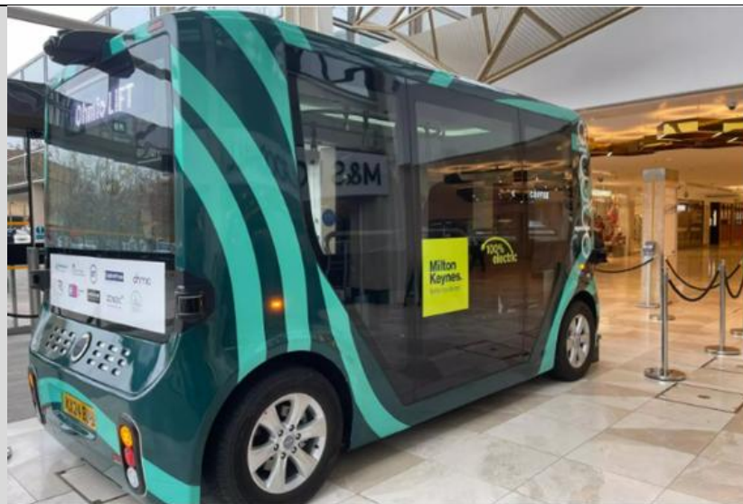
Autonomous shuttle trials in

The Chancellor stated that data shows that a third runway could boost GDP by 0.43% by 2050.