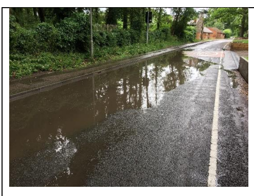
Flooding following recent storms

This consultation focuses on the Department for Education's proposed contract with Glebe Farm School, funding the school places to be made available from September 2022. This consultation is important and IFTL is interested to hear from all stakeholders about its plans for the school.