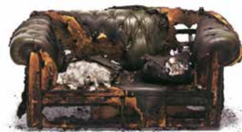
THE ASH FROM ONE CIGARETTE

If you are not ready to give up - or while you are giving up - you should bear in mind the fire risk associated with smoking and take note of this advice from Buckinghamshire Fire & Rescue Service to help reduce the chances of your smoking materials leading to a fire.